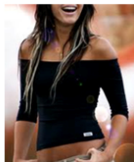
strapless and off shoulder tops

"What you wear to the mall or beach may not be appropriate for school and work."