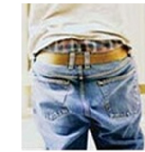
Short clothing, ripped and low rise pants