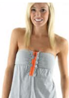
tube tops and strapless tops